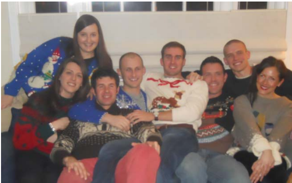
Resident Holiday Party